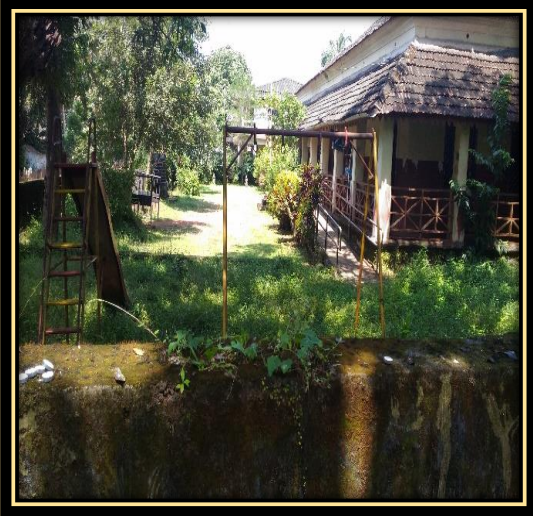
1. ANGANWADI – CORMUGAL