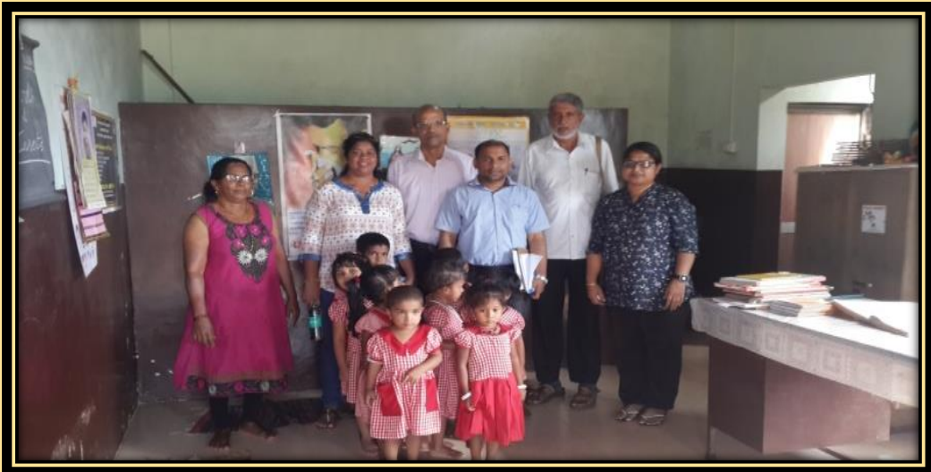
2. ANGANWADI – BHATTI