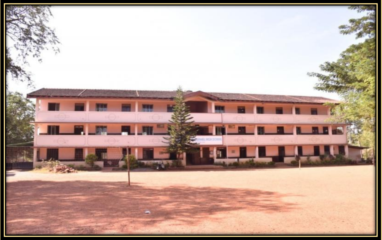
OUR LADY OF CARMEL HIGH SCHOOL ANVOTTEM CURTORIM