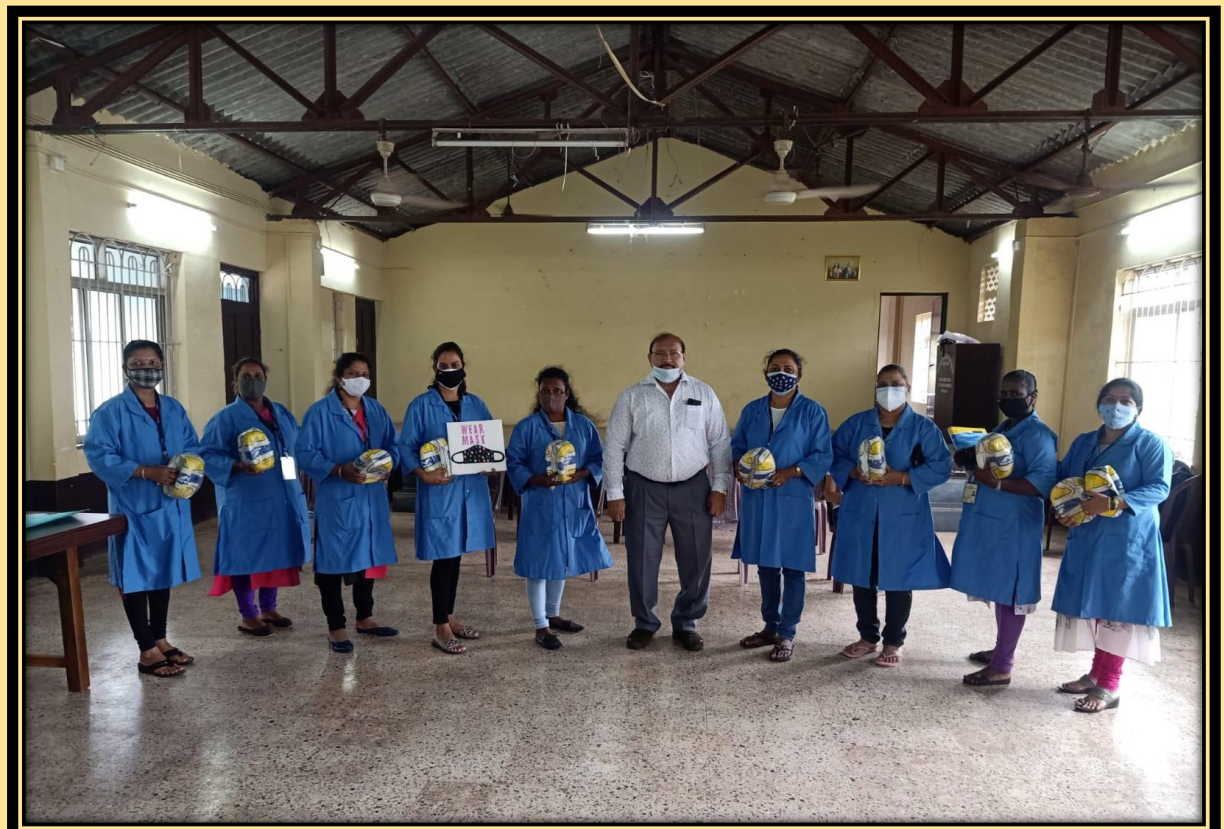
Distribution of Volleyballs to Aganwadi Workers