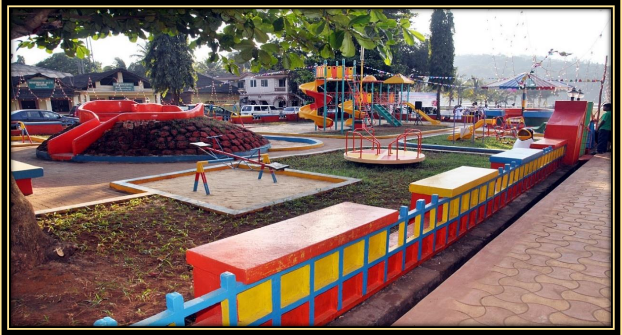
ST. ALEX CHURCH GARDEN