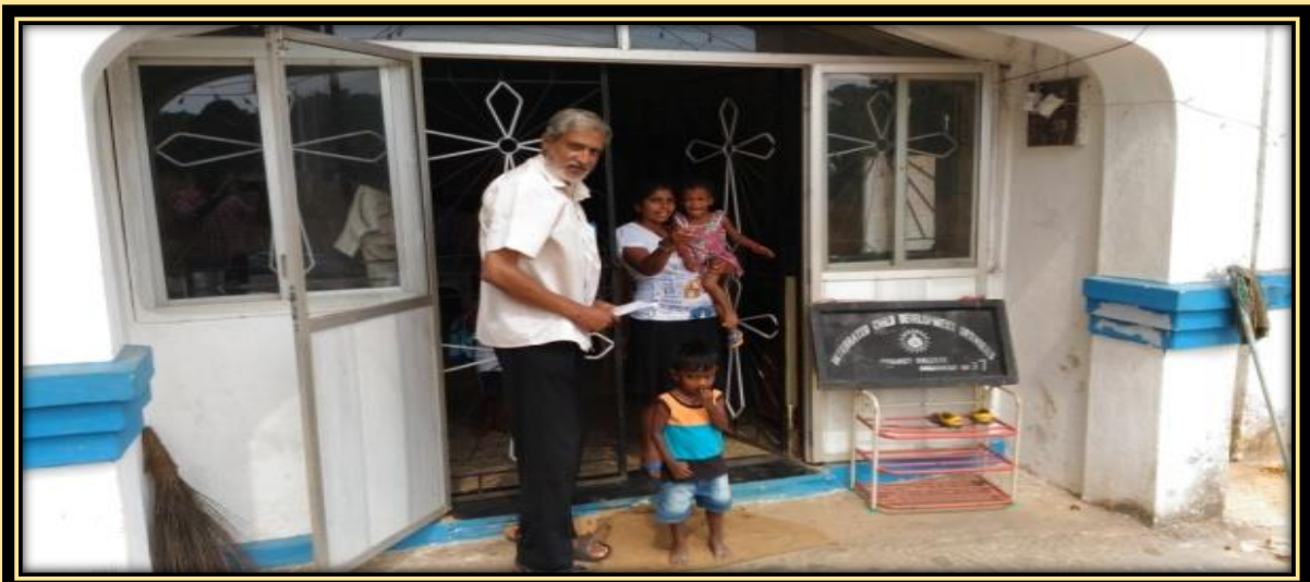
9. AGANWADI - AGXEM