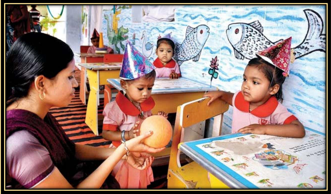
10. AGANWADI - MAINA