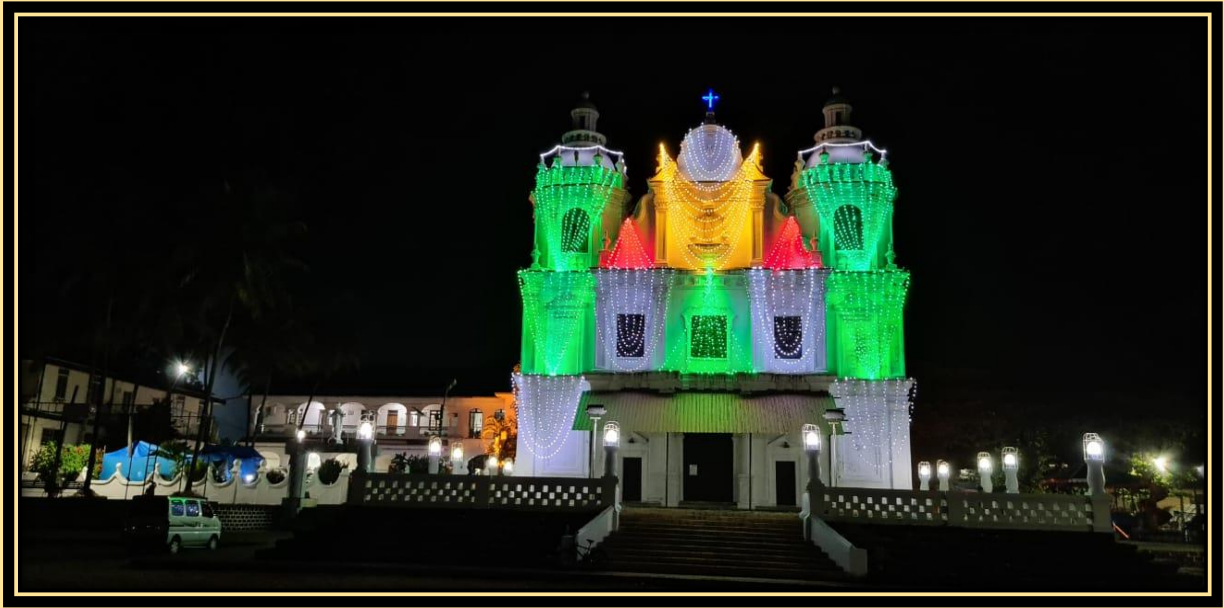
St. Alex Church Curtorim (Night view - Christmas Season)