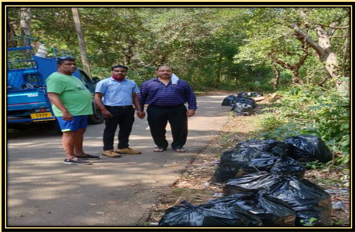
Garbage Collection in Curtorim Jurisdiction