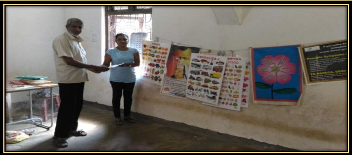
8. AGANWADI - CORJEM