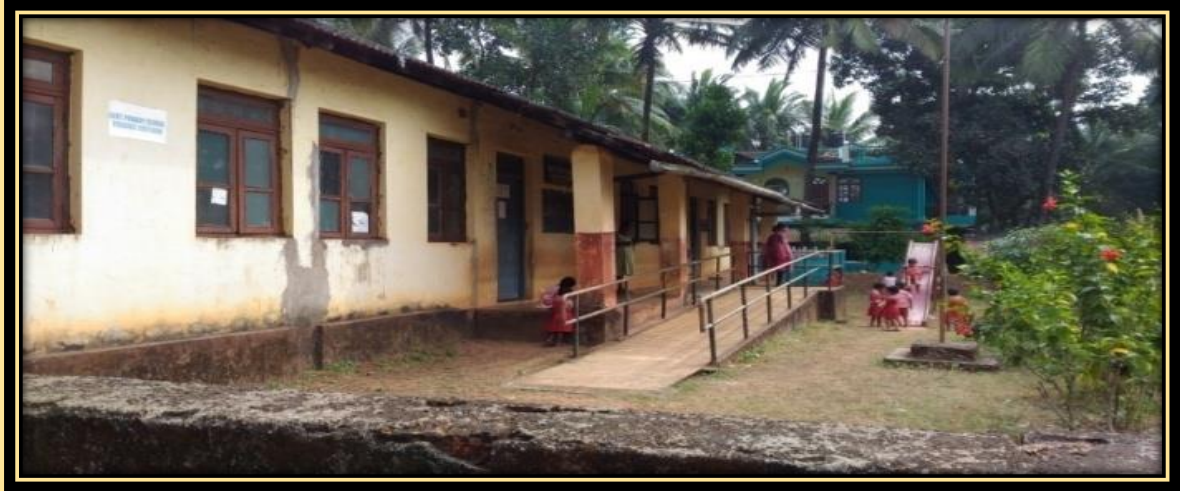
7. AGANWADI - VIRABHAT