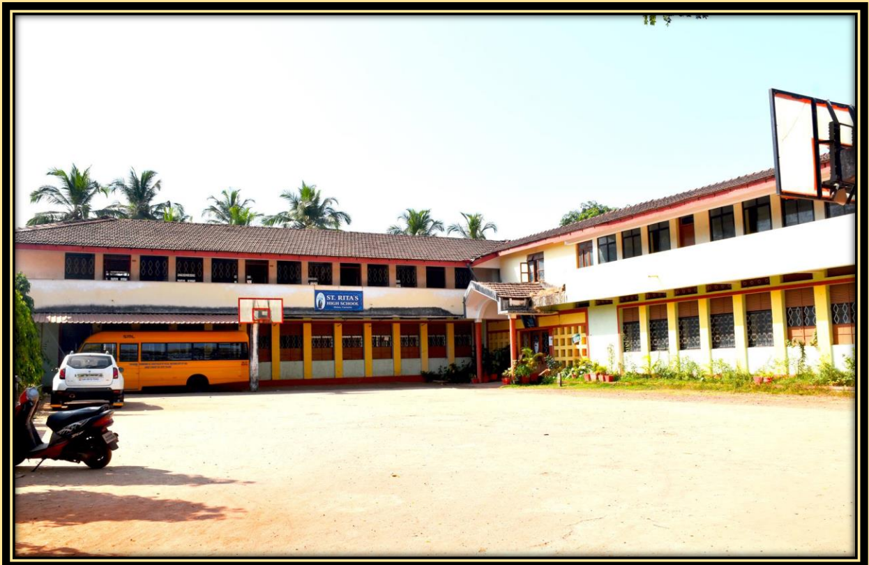
ST. RITA HIGH SCHOOL MAINA CURTORIM